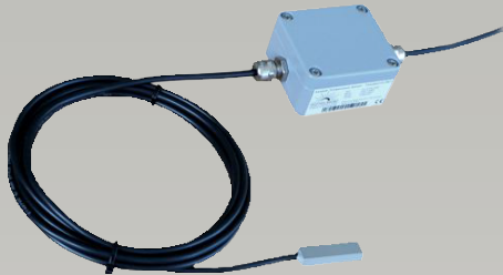
▶ Module Temperature sensor