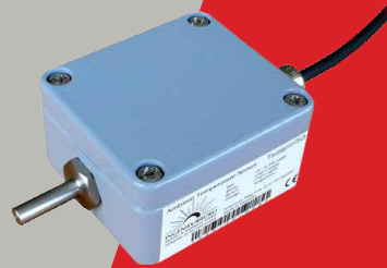
▶ Ambient Temperature sensor