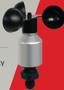
▶ Wind Velocity sensor