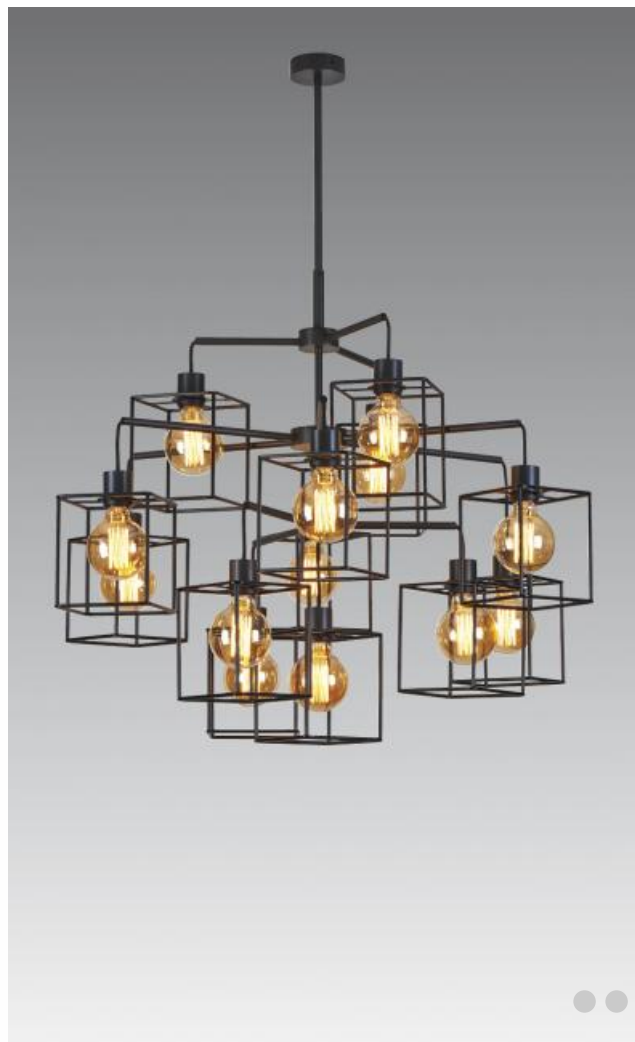
KERMA LUSTRE in brushed bronze with structures in black epoxy finish