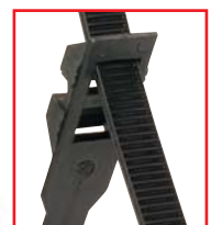
TEMPORARY INSTALLATION (RELEASABLE CABLE TIE)