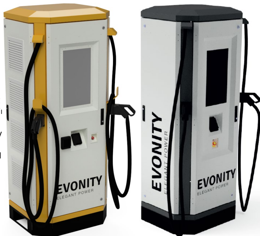
The shown pictures are for illustrative means and can deviate from the end product