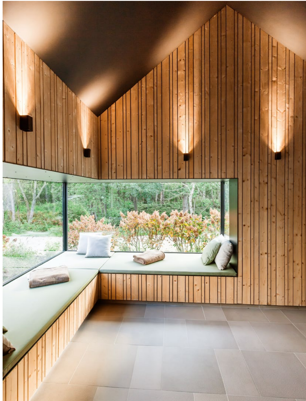
HOTEL DOMAINE DE LA VOISINE FRANCE