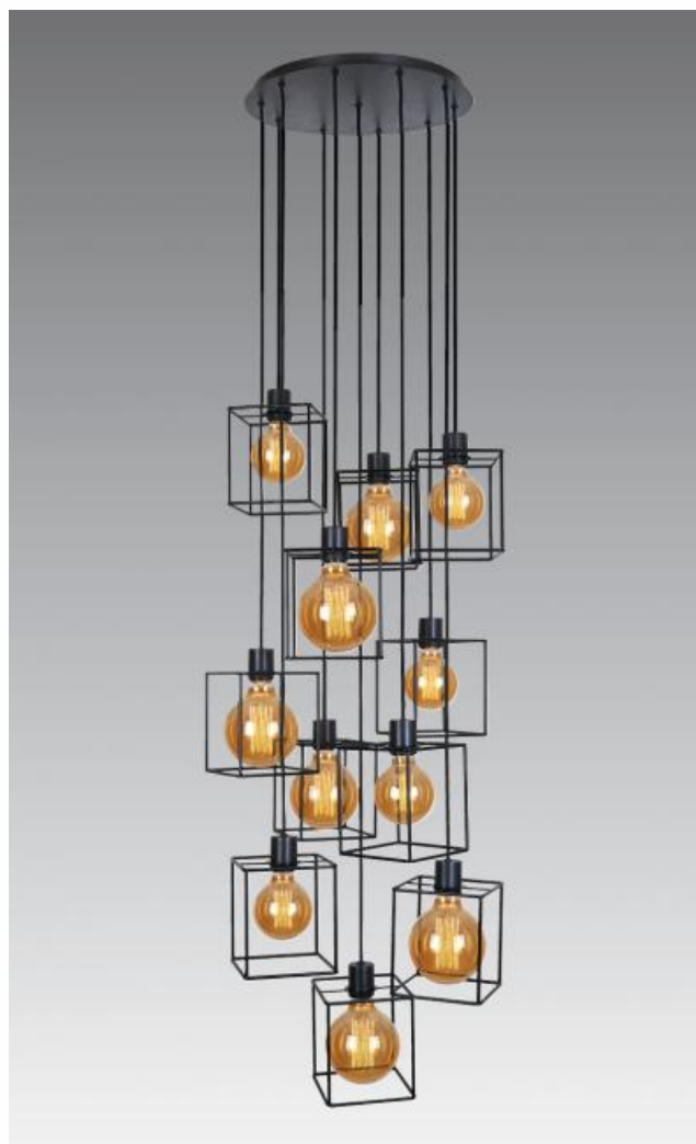
KERMA 11 o in brushed bronze with structures in black epoxy finish